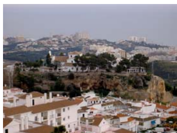
Clear February days !!