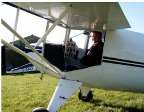
Happy Luscombe Owner