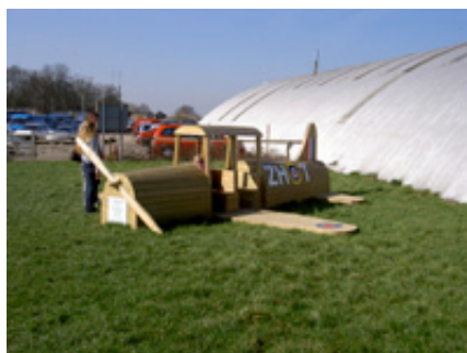
Headcorn Flight Simulator