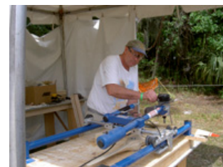
"Propeller making at Sun n Fun."