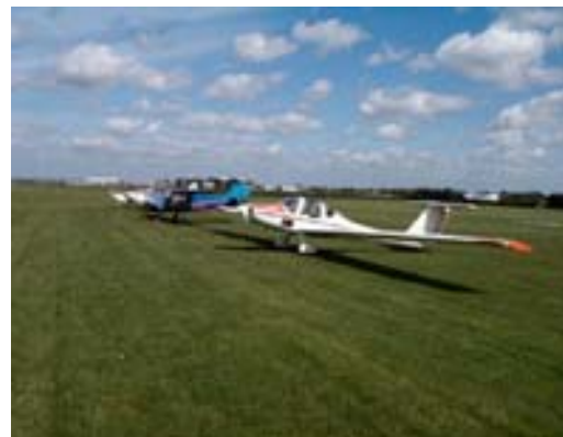
Cross Channel Newbies Line Up