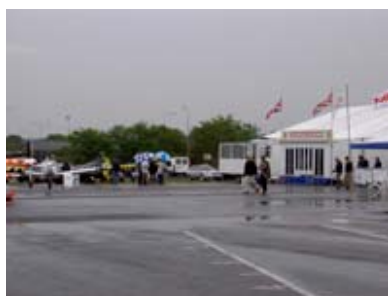
A very wet Aerofair 2003