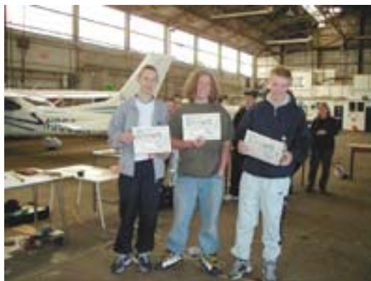
Young Eagles Balloonists - See report on page 4

Excellent news from the Medway elections is that the Conservatives have now gained a respectable working majority over the opposition so hopefully some of our antagonists have got their comeuppance. What ever your political persuasion this is at least an optimistic result for the airport as the Conservatives have stated publicly that they will maintain things as they are, however time will tell. We can only hope, they are, as we all know, an honourable bunch!