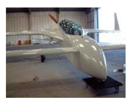
Another view of the new Varieze

June 29 Old Sarum June 26 Monthly Meeting July 6 Pancake Fly In August 3 Old Buckenham Sept 7 Laddingford Fly In