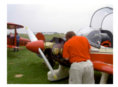
What's wrong now!!