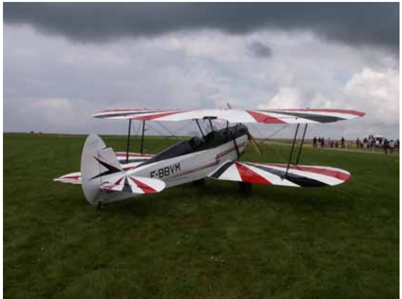
Stampe at Dieppe

I don't know what it is about me and Abbeville but the number of times that in the past I have been weathered in going out or coming back are not infrequent and so it was that, despite a not too pessimistic forecast for the weekend, we found ourselves patently not going anywhere for the foreseeable. A decision quickly made, in to Abbeville for a walk round, lunch and back to the