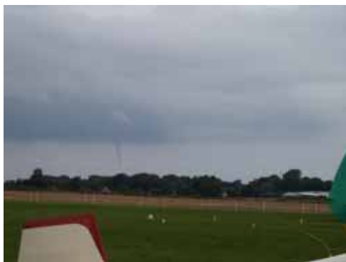
Waterspout at Dieppe

In the clubhouse 10 minutes later the rain comes down in stair rods and thus ends flying for the day.