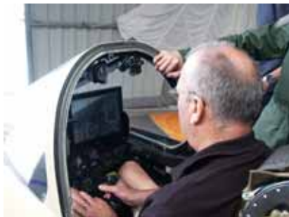
Flying the Simulator