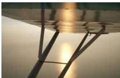
Nice Flight Home