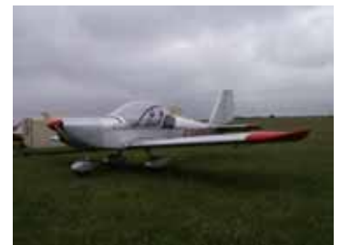
Waiting the weather at Abbeville