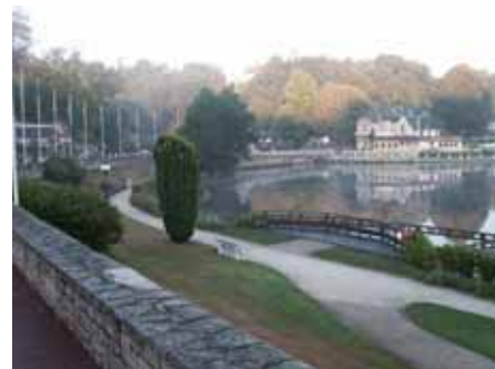
Bagnoles in the Misty Morn

around the exhibits and military re-enactment camp, waterspout spotting as one appeared in the Channel and flying a Mirage Fighter Simulator. Simon and I both had a go at the landing approach the only difference was that he piled it in off the field and I managed to prang all the hangers. Good fun.