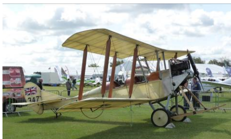
C Boddington's BE2 Replica G-AWYI