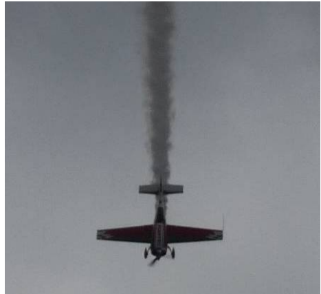
Extra against a dull sky

afternoon display was not exactly bathed in bright sun. These are actually colour photos.