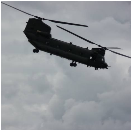
Chinook Display on Sunday

Give a man a fish and he will eat for a day. Teach him how to fish, and he will sit in a boat and drink beer all day.