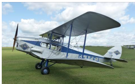
DH83 Fox moth G-ACEJ