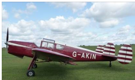
Miles M38 Messenger 2A G-AKIN

But the weather did brighten up for these pictures!