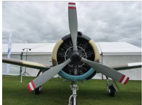
Too big for an LAA permit, the North American T28 Trojan (ex French Air Force Fennec)

Give a man a fish and he will eat for a day. Teach him how to fish, and he will sit in a boat and drink beer all day.