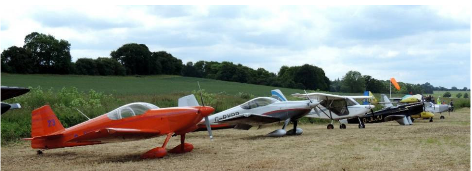
Some of the visiting aeroplanes