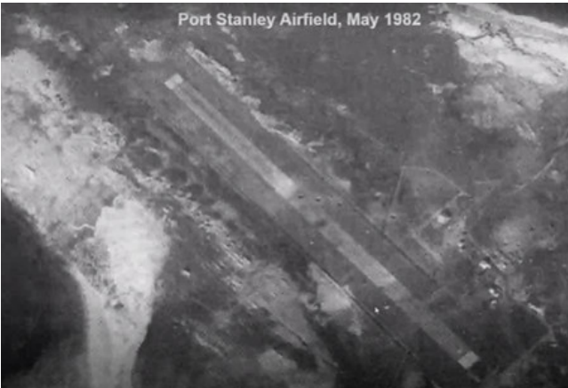
Operation Black Buck