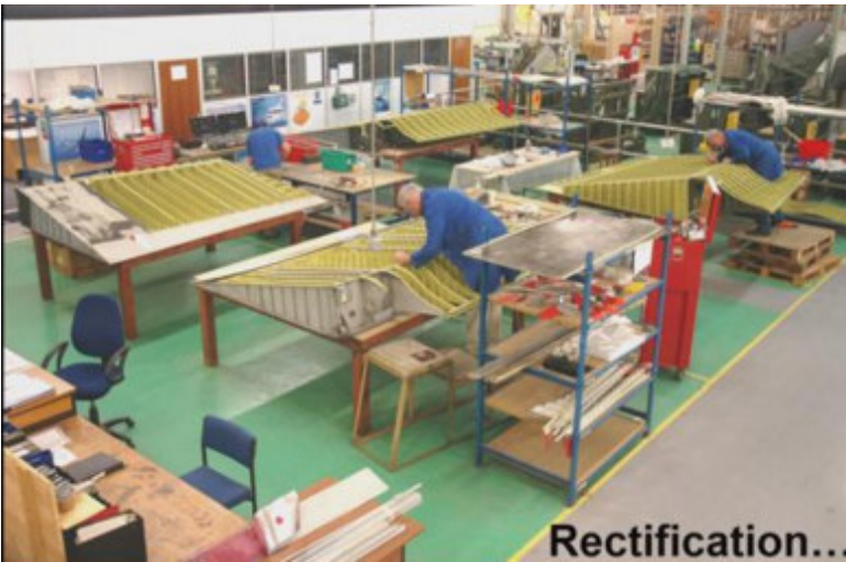
Larger than your average control surface