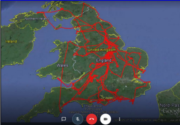
Track of XH558 during its return to the air.