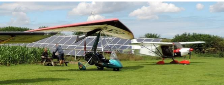
A couple of visiting microlights