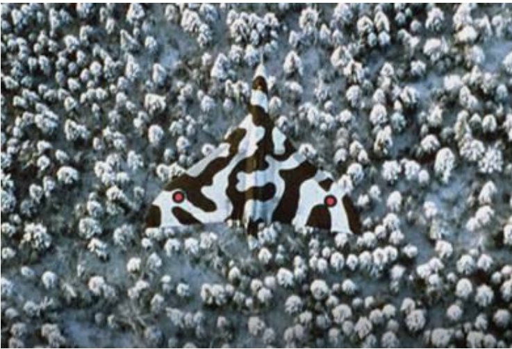
Transition to low level penetration role in the early 1960's