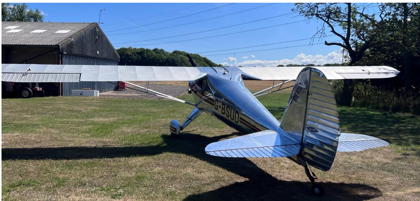
Photo: G-BSUD At Farthing Corner