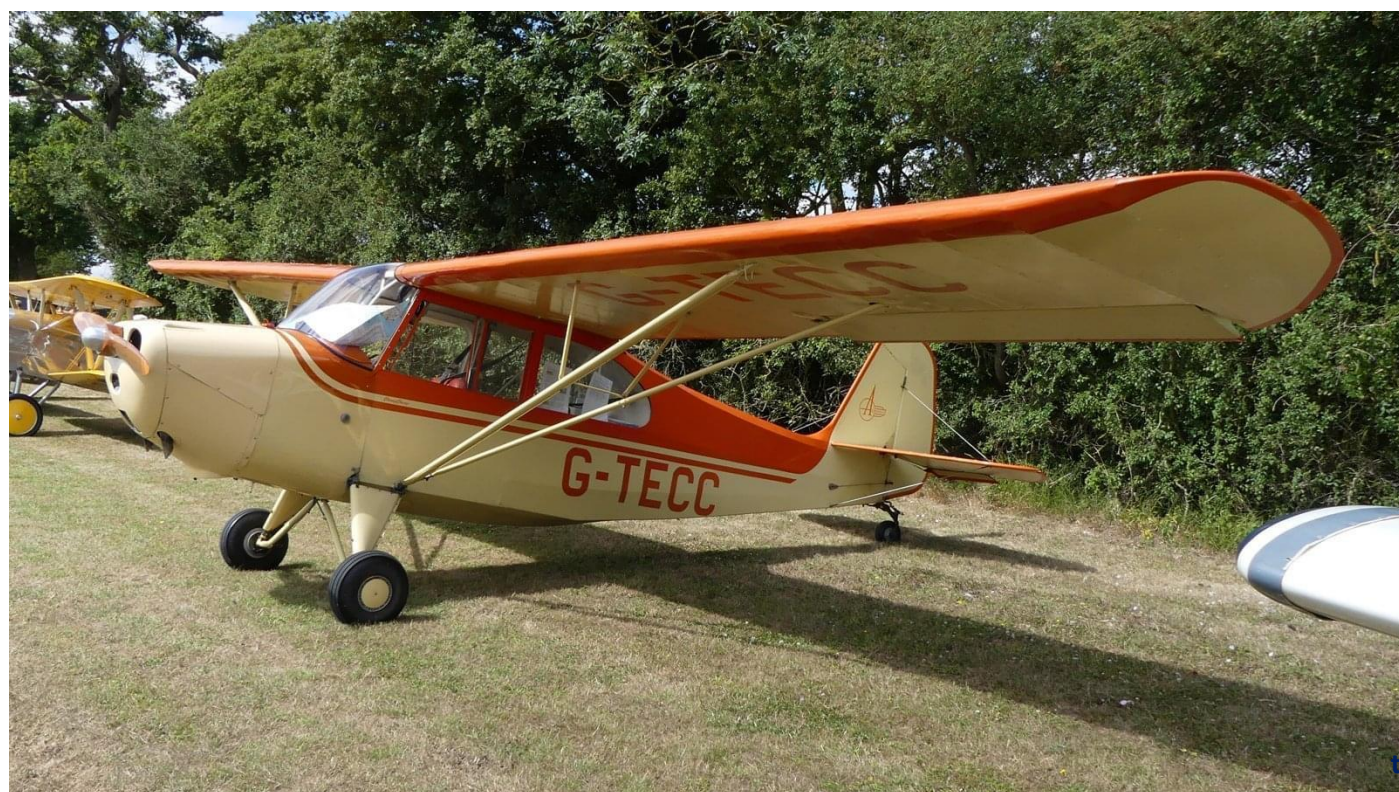
Photo: Kent Strut spotted at the Suffolk Strut Flyin at Monewden