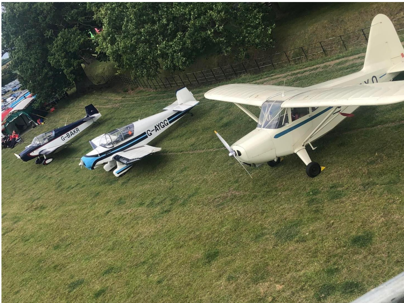
Photo: Kent Strut spotted at Heavingham Hall