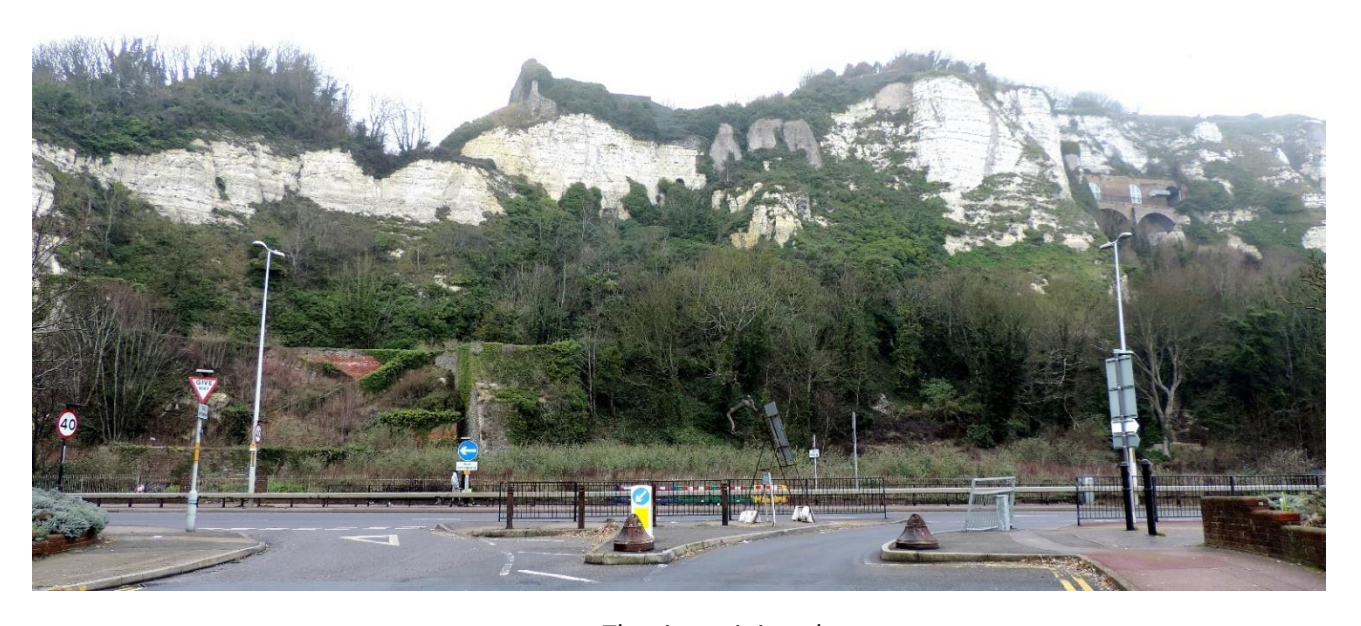
The site as it is today

The service will run in connexion with the boat trains, and the crossing will take only a quarter of an hour. The fleet will at first consist of four or five small seaplanes each carrying two or three passengers, but it is hoped that later it may be possible to increase the number of seaplanes and run special trains in connexion with the air crossing. Reuter.